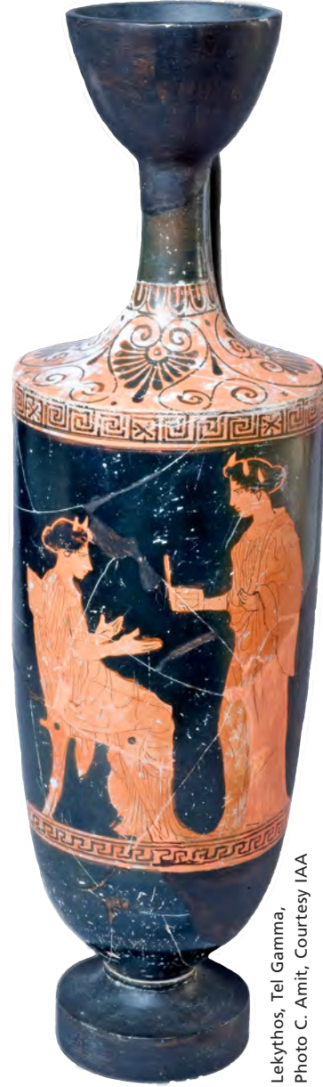
Lekythos, Tel Gamma